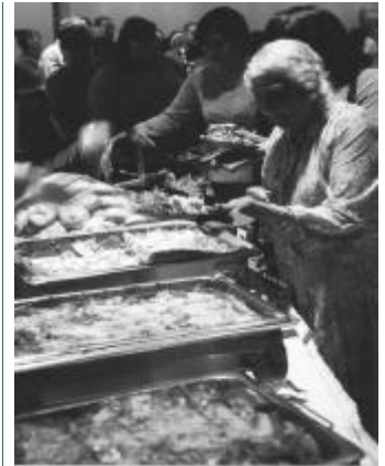
Guests enjoy delicious lasagnas at KHS' 14th Annual Lasagna Dinner.