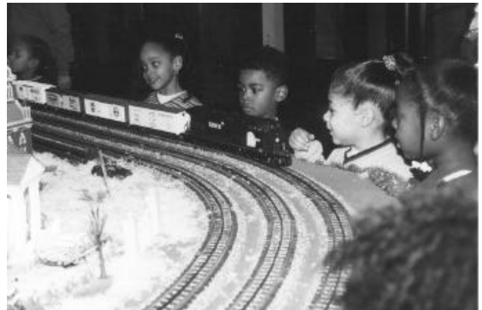
The Nurturing Place children enjoy the annual holiday train exhibit at the invitation of our friends at 101 Hudson Leasing Associates.

Friends old and new pitched in to help us make the season bright for the women and children whom we serve. This year's gift giving was extraordinary in that we received items that were needed for each of our programs. The presents came from far and near and included such delights as: toys, baby goods, women's and children's clothing, business accessories to assist our Kenmare women during their interviews and internships, and food for the soup kitchen.