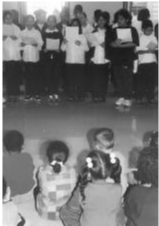
Students from P.S. 16 (grades 5,6,&7) give a stunning Christmas Caroling performance for the kindergarten and pre-k classes of TNP.